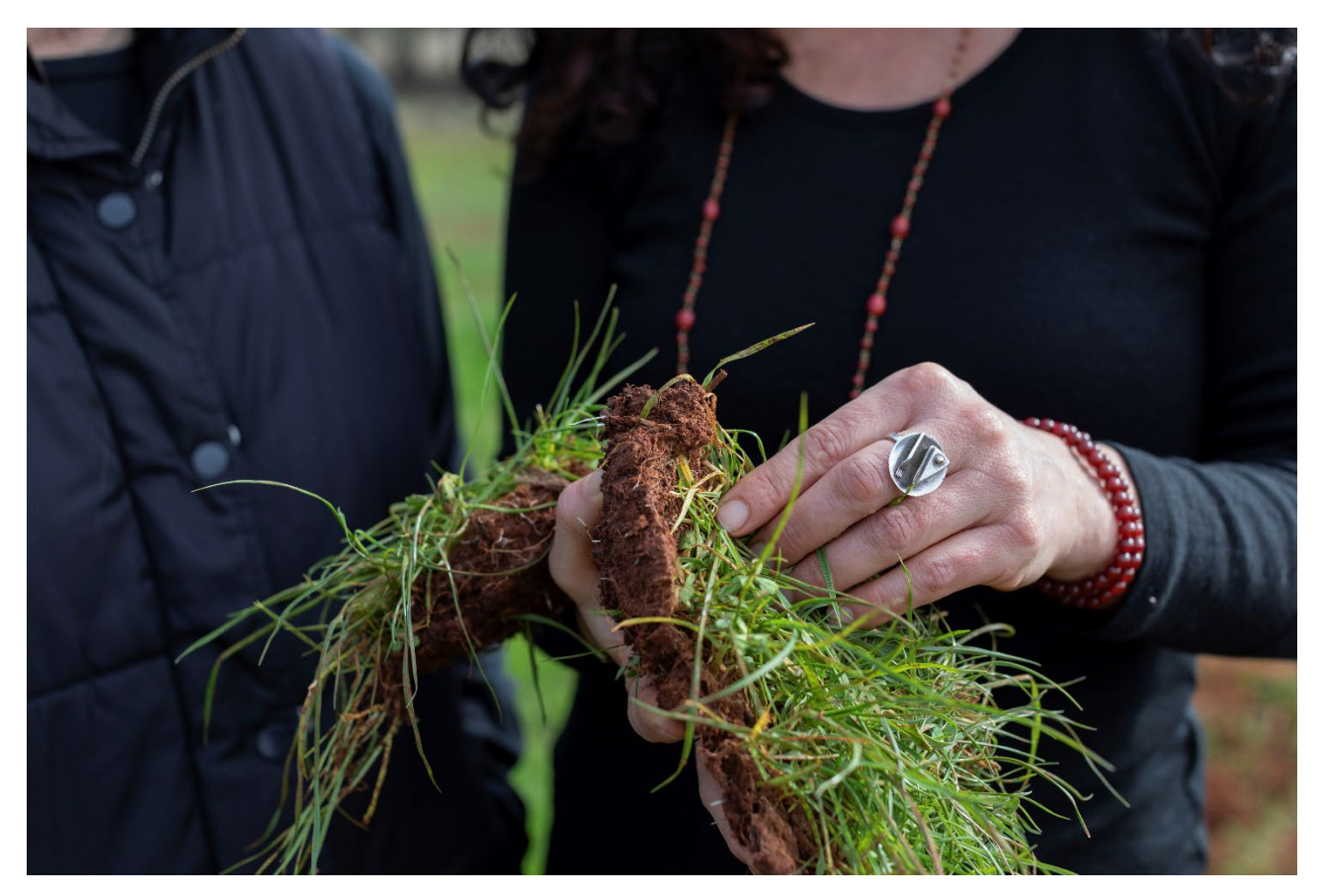
Image 1. Photo taken for the Office of Energy and Climate Change. NSW Treasury