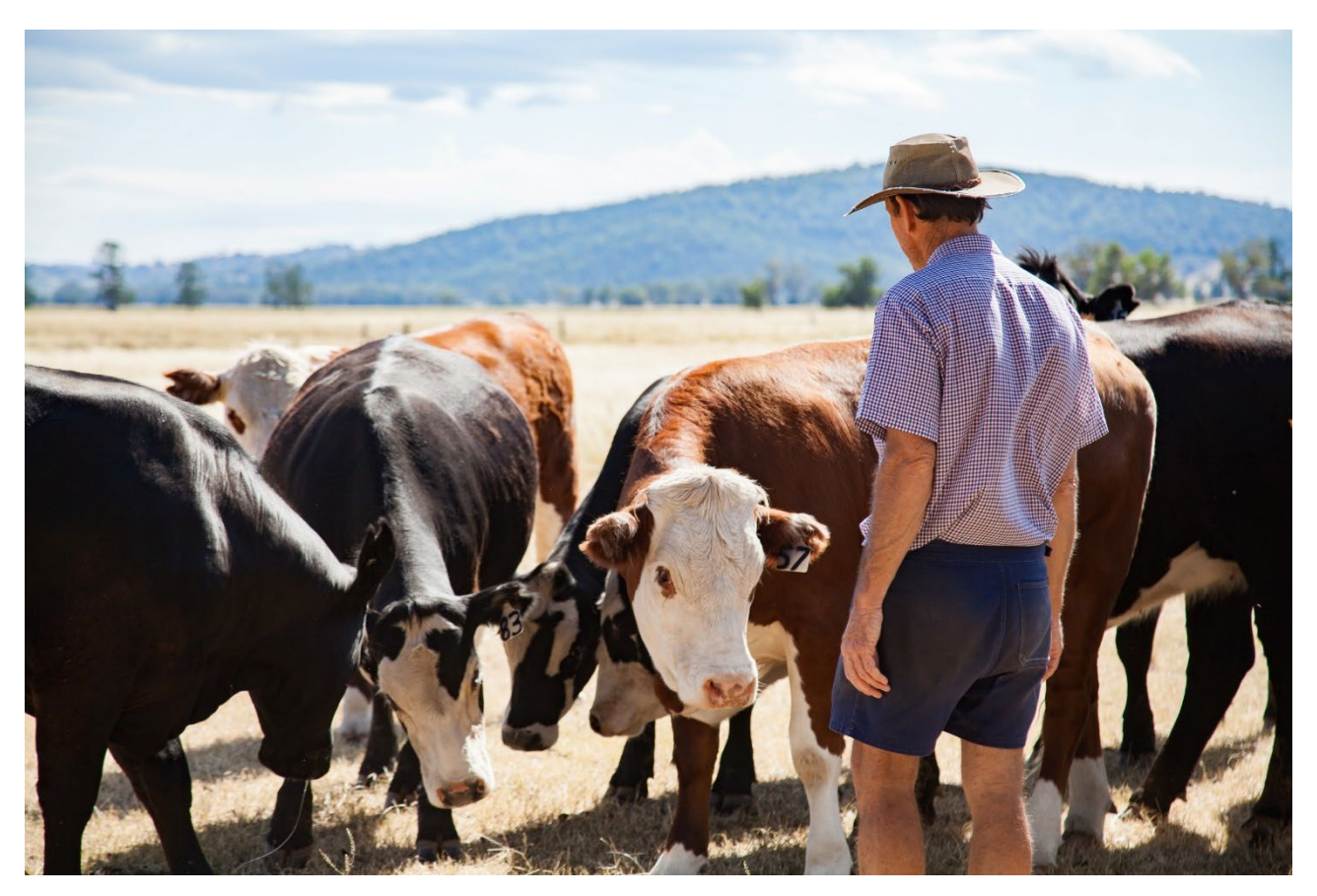
Image 2. Photo taken for the Office of Energy and Climate Change. NSW Treasury