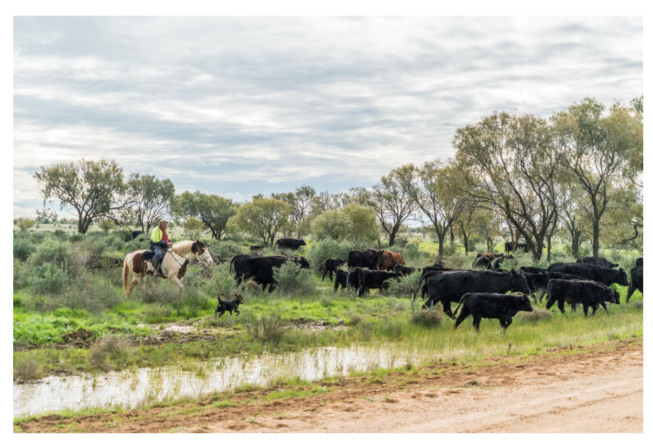
Image 3. Horseman on a cattle drive in the Murrumbidgee Shire

If you have any questions about this funding opportunity, please email us at <a href="mailto:netzero.land@environment.nsw.gov.au">netzero.land@environment.nsw.gov.au</a>